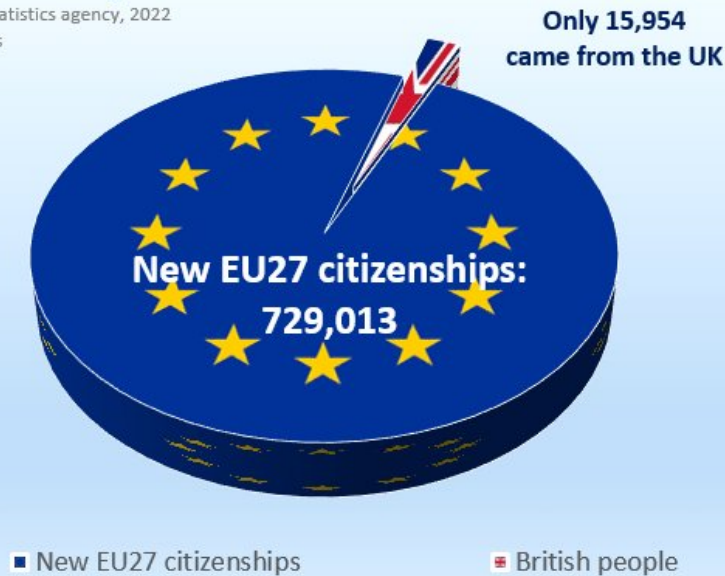
Chart copyright Facts4EU.Org 2022 Source: EU official statistics agency, 2022 See article for details

© Brexit Facts4EU.Org – click to enlarge