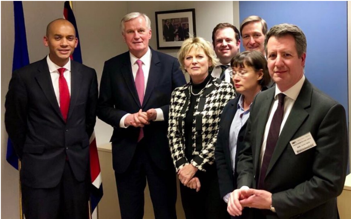
Extreme Remainers meeting EU Chief Negotiator in Brussels, 15 Jan 2018