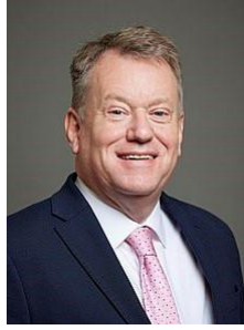
Baron David Frost

CIBUK are delighted to announce that Lord Frost has accepted our invitation to become a patron of CIBUK. He joins a distinguished list of fellow Peers of the Realm as well as Members of the House of Commons.